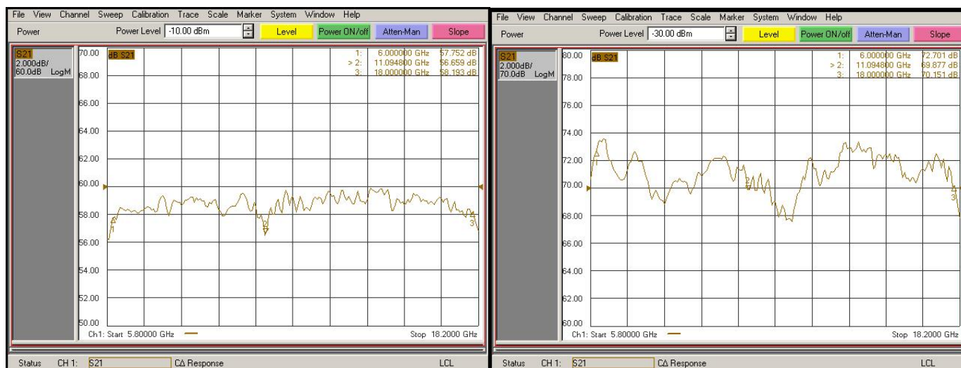
Figure left: Power Gain S21@ Pin=-10dBm (Ambient temp. +25±2°C, Load VSWR ≤ 1.2), For Reference Only(Shipped Products)