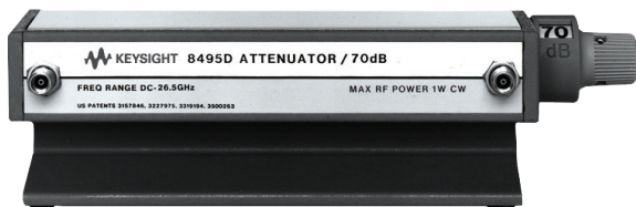
Figure 3. Manual step attenuators.

Keysight manual step attenuators offer fast, precise signal-level control up to 26.5 GHz. Unmatched attenuation repeatability of less than 0.03 dB up to 5 million cycles per section ensures low measurement uncertainty. Attenuation range of 121 dB in 1 dB step can be achieved by cascading 2 attenuators in series.