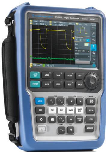
The R&S®Scope Rider RTH offers a wealth of functions for automotive applications.

With the R&S®RTH-K9 CAD-FD serial triggering and decoding option based on the R&S®RTH-K3 CAN/LIN serial triggering and decoding option, the user can analyze CAN-FD signals. At transmission rates of up to 15 Mbit/s, the CAN-FD serial bus is significantly faster than standard CAN (up to 1 Mbit/s) and is gaining in importance.