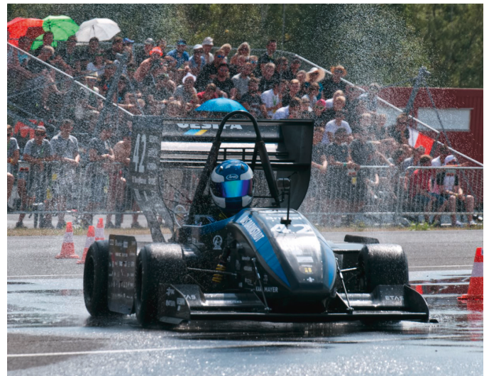
F18 Clara on the wet surface of the Most circuit in the Czech Republic

At the first race of the 2018 season in late July in Most (Czech Republic), F18 Clara came 12th out of 32 teams despite unfavorable circumstances. The race was stopped prematurely due to a thunderstorm. In early August 2018, the team achieved a very respectable 16th place with the F18 Clara at the Hockenheimring circuit in a field of 58 teams with combustion engines. In the last race of the season at the end of August 2018 on the slippery pavement of the Circuit de Barcelona-Catalunya, the F18 managed to achieve 10th place overall. This year, the car once again showed that it performs reliably even under adverse conditions.