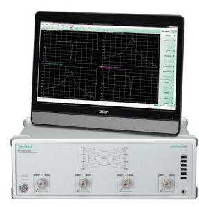
ShockLine<sup>™</sup> Vector Network Analyzer