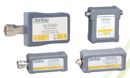
USB Power Sensors MA24xxA