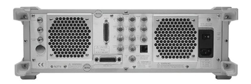
RF/Microwave Signal Generator MG3690C